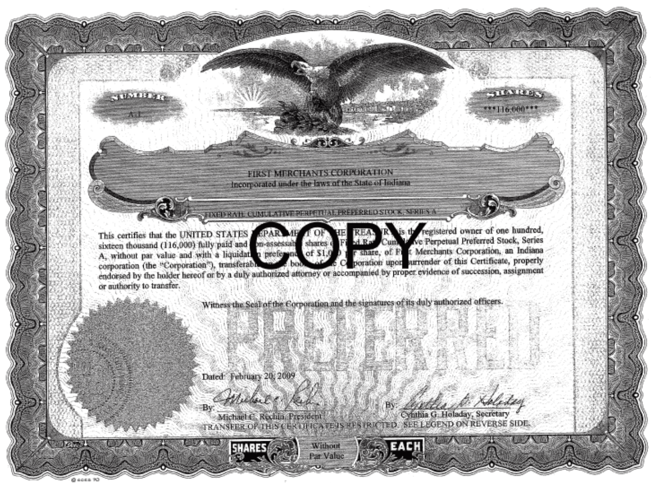
UST Seq. No. 745